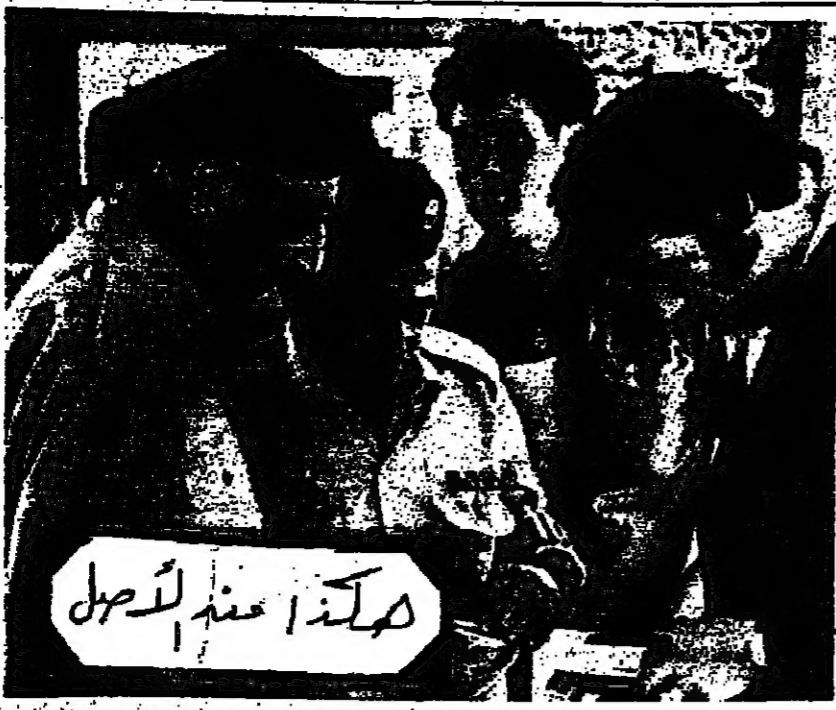
Volunteer policemen check papers in Jerusalem.